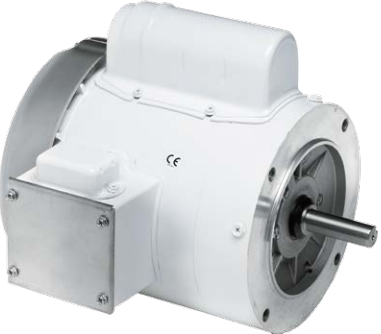
Single phase 1/3 HP through 1-1/2 HP 3600 and 1800 RPM 115/208-230 Volts